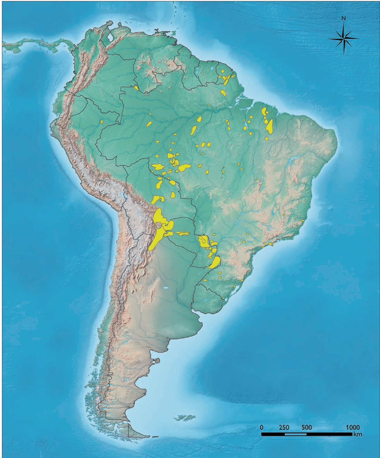
Figure 2. The distribution of the extant Tupian languages (L. Eriksen).